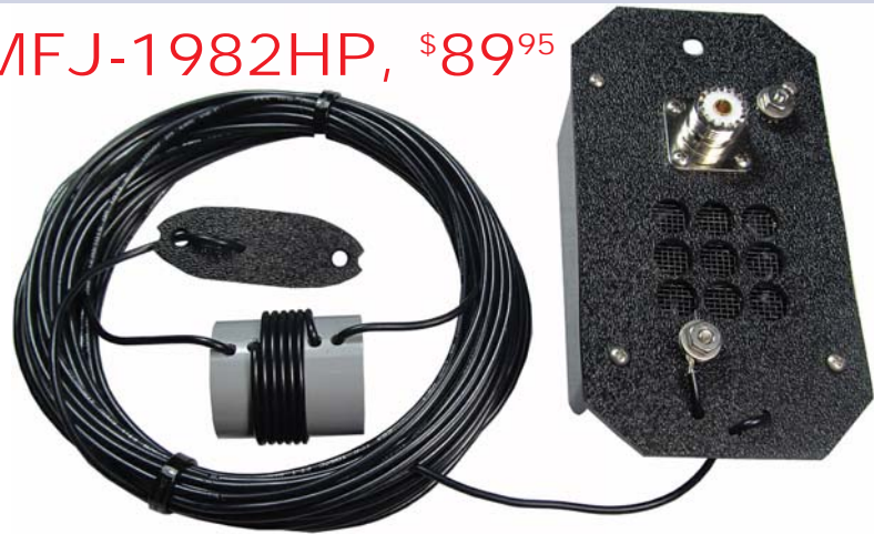
Typical SWR, MFJ-1984 LP